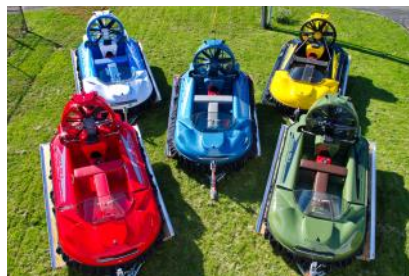
Unique color packages to match your individual style. You can stand out from the crowd or blend in; it's up to you.