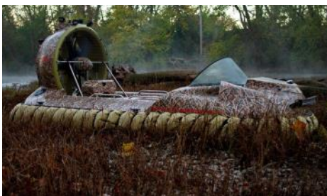
Our Duck Pro 2 is loaded with a full camo wrap and unique features to be the ultimate waterfowl hunting vehicle.

Engine/Fan frame/Exhaust/transmission - All saltwater ready with stainless steel and aluminum on most components